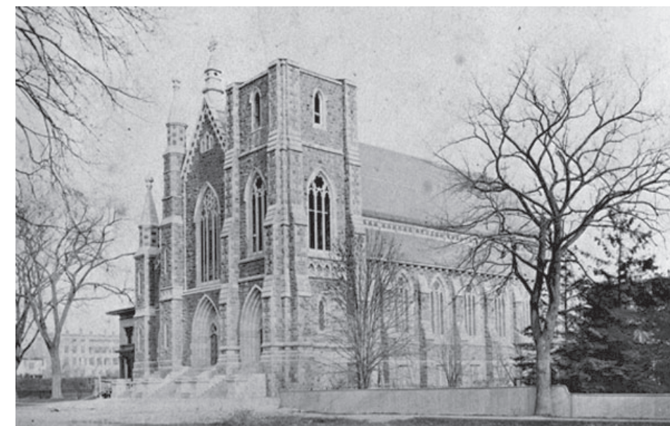
Birthplace of the Knights of Columbus, St. Mary's Church in New Haven, CT is the subject of this late-19th century photograph.