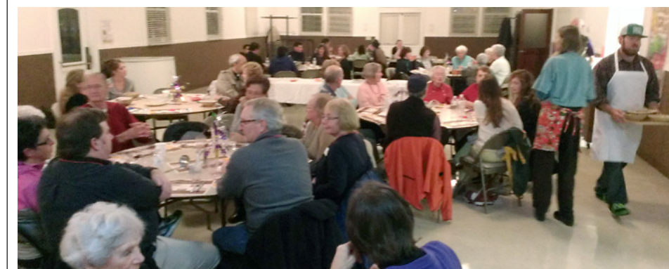
The packed house at our February social. Join the fun and enjoy the great meals and great conversations! And your support helps us support worthy causes!