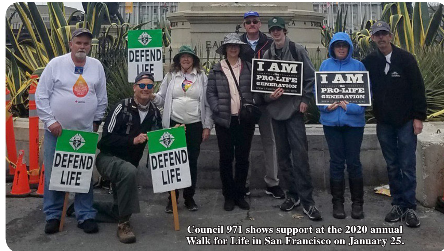
Council 971 shows support at the 2020 annual Walk for Life in San Francisco on January 25.